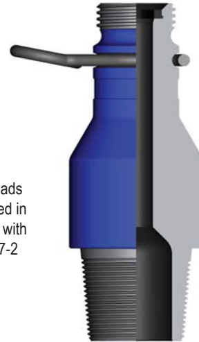
Rotary threads manufactured in accordance with API Spec 7-2